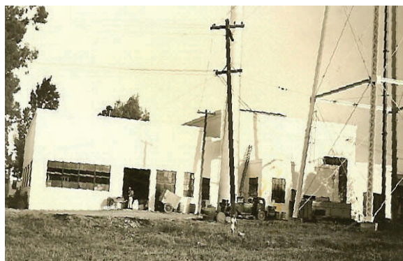
The Hospital's laundry building.