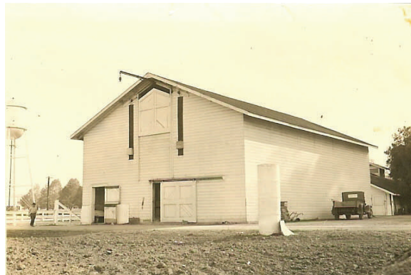
The horse barn illustrates the County Hospital's rural setting in the late 1930s.