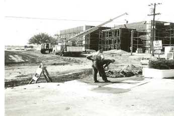
Construction of terminal, Reid-Hillview Airport, 1970, from County Photographers Collection.