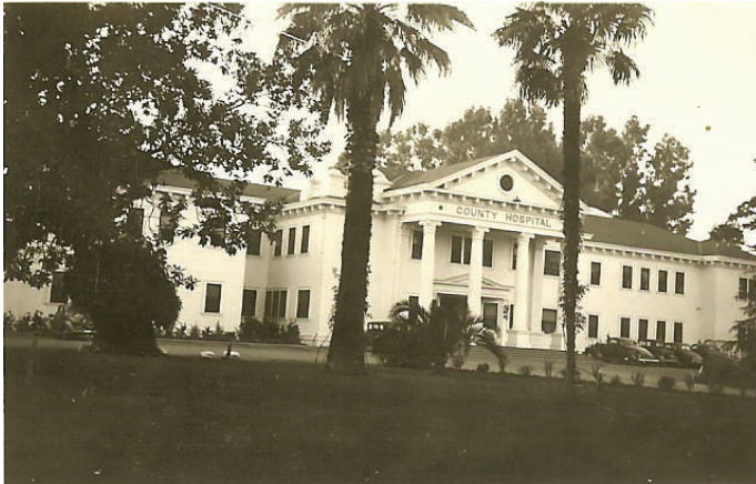
Main Building. This part of the hospital was insured for $70,000. Its contents were insured for $18,000.

The photographs below show the Valley Medical Center, then known as the County Hospital, as it was in 1937. They are taken from an analysis of County fire protection insurance prepared for the Board of Supervisors. This analysis, and a second one prepared in the 1960s, contain numerous pictures and diagrams of County buildings.