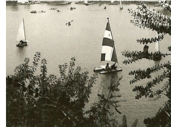
Boating at Vasona Park.