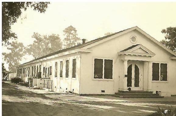
This building was the Hospital's boiler room.