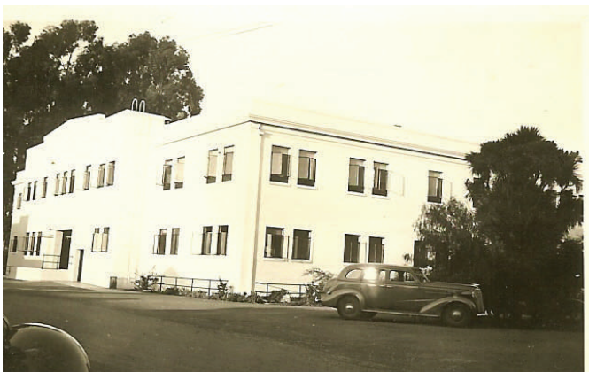
Kitchen and Dining Room