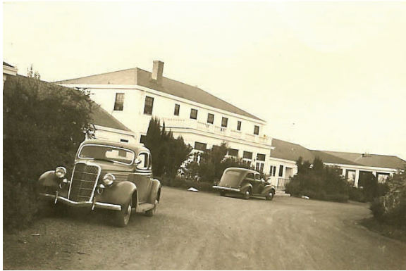
This building was known as the Preventorium.