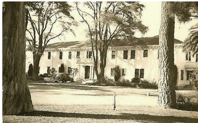
Nurses' Cottage. This residence was insured for $31,000 for the building and $2000 for the contents.